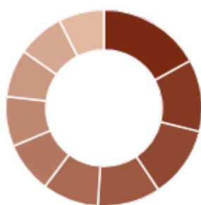
Top 10 Holdings