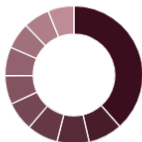
Top 10 Holdings